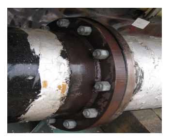
Water main junction cleaned up for inspection & recoating