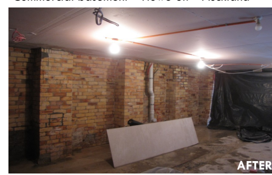
Now ready for waterproofing