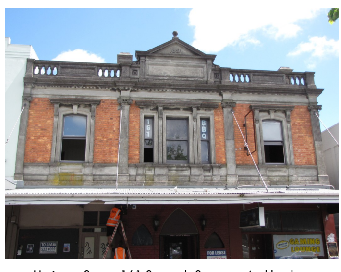
Heritage Status, 161 Symonds Street — Auckland