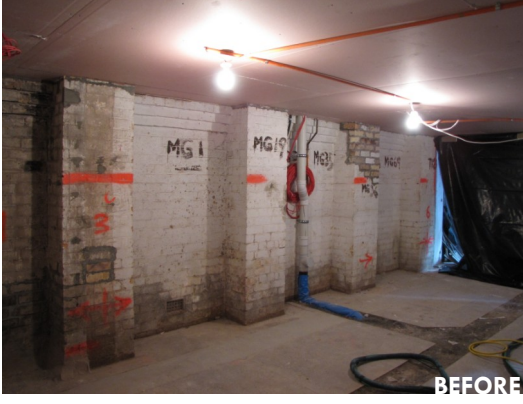
Commercial basement—Howe St.—Auckland